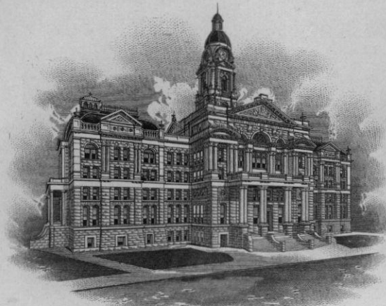
TARRANT COUNTY COURT HOUSE